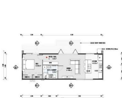
55 sqm from $145,000